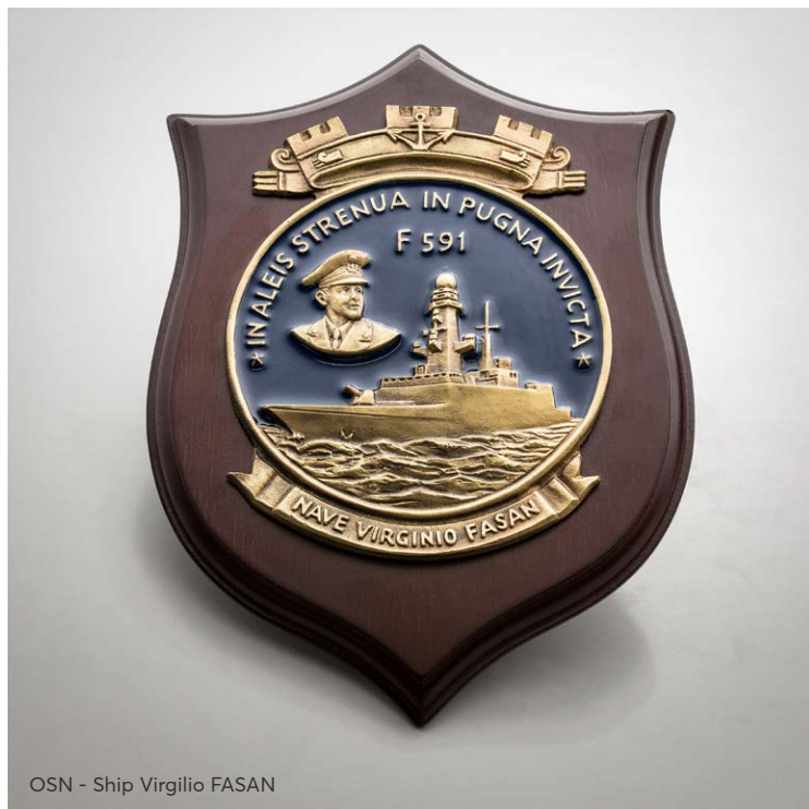
OSN - Ship Virgilio FASAN