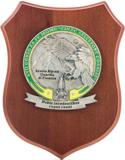
Alpine Italian Finance Police School (2019)