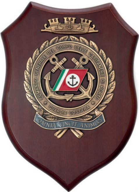
General Commando for Port Captaincy – Coast Guard (2018)