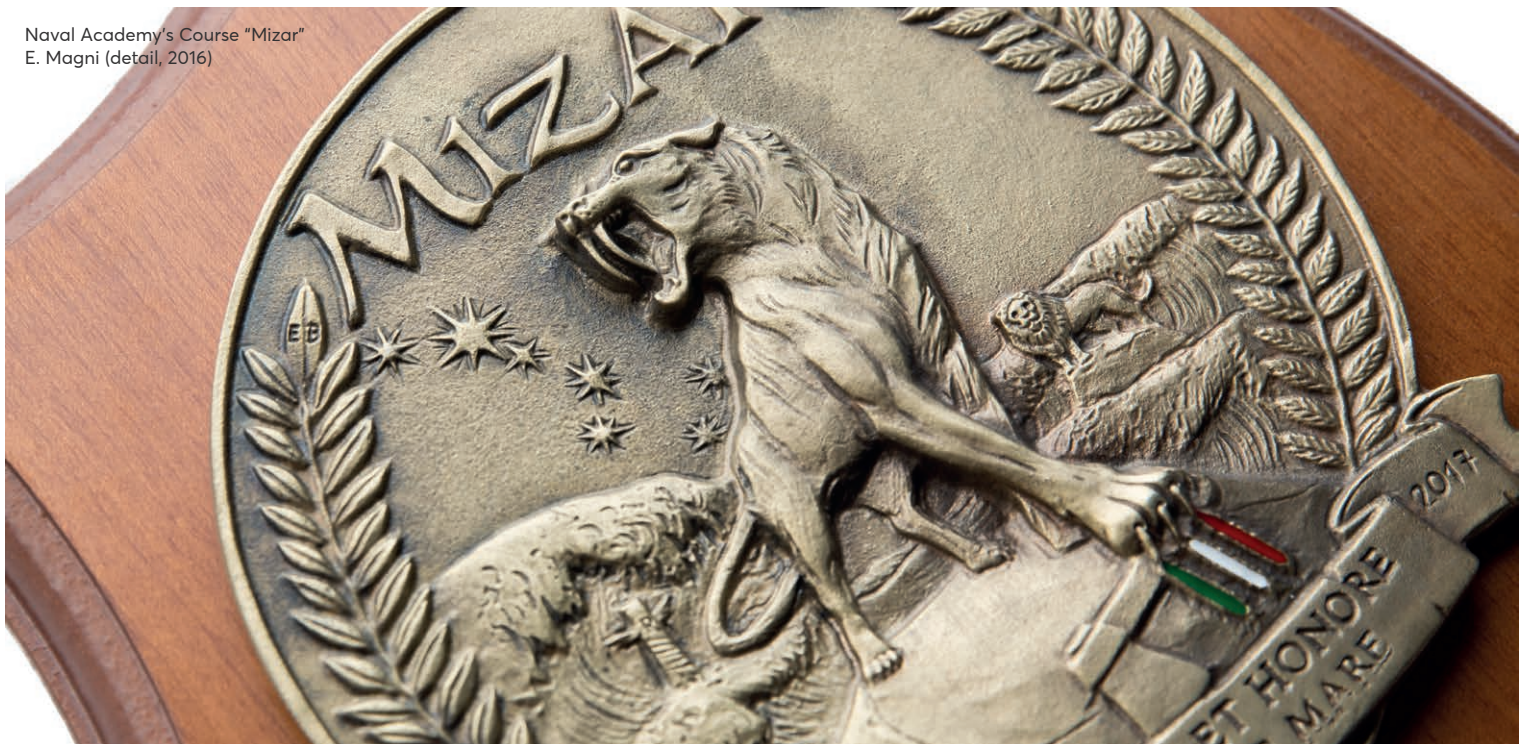
Naval Academy's Course "Mizar" E. Magni (detail, 2016)