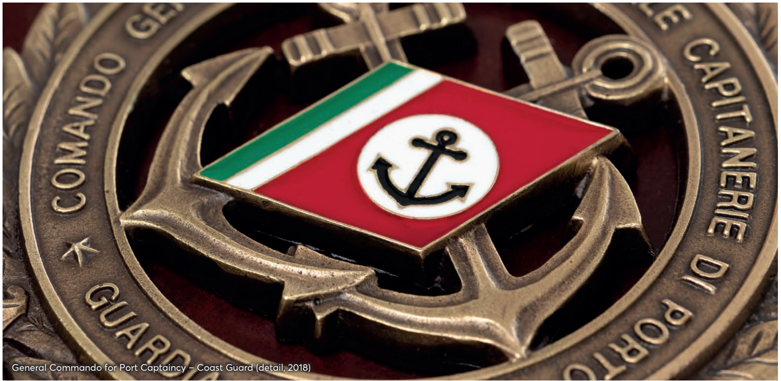
General Commando for Port Captaincy – Coast Guard (detail, 2018)