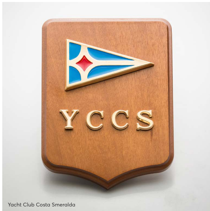
Yacht Club Costa Smeralda