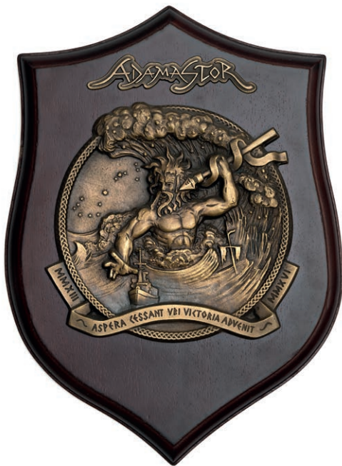
Naval Academy's Course "Adamastor" (2016)