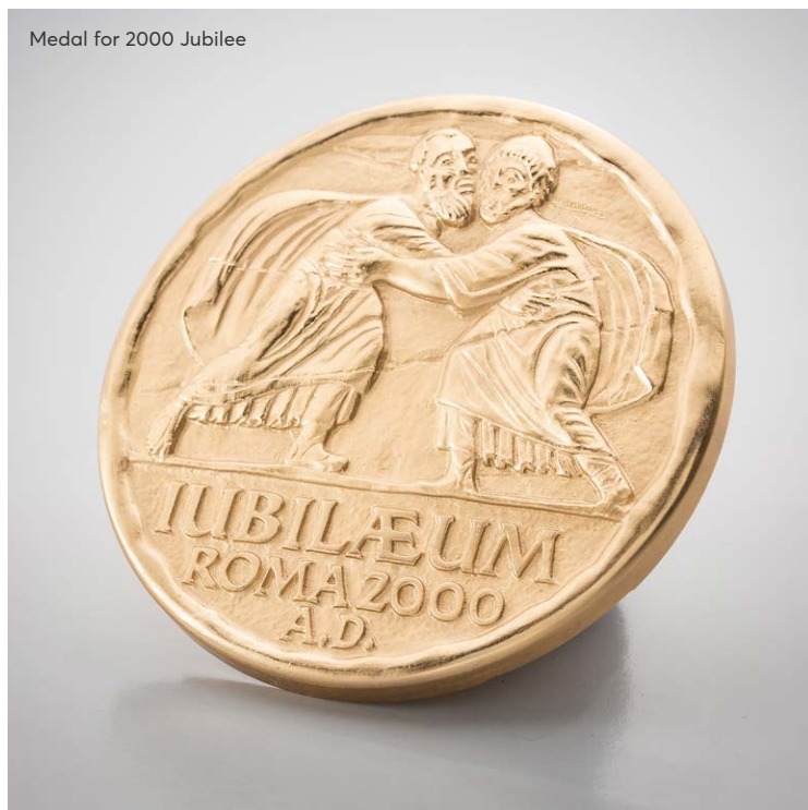
Medal for 2000 Jubilee