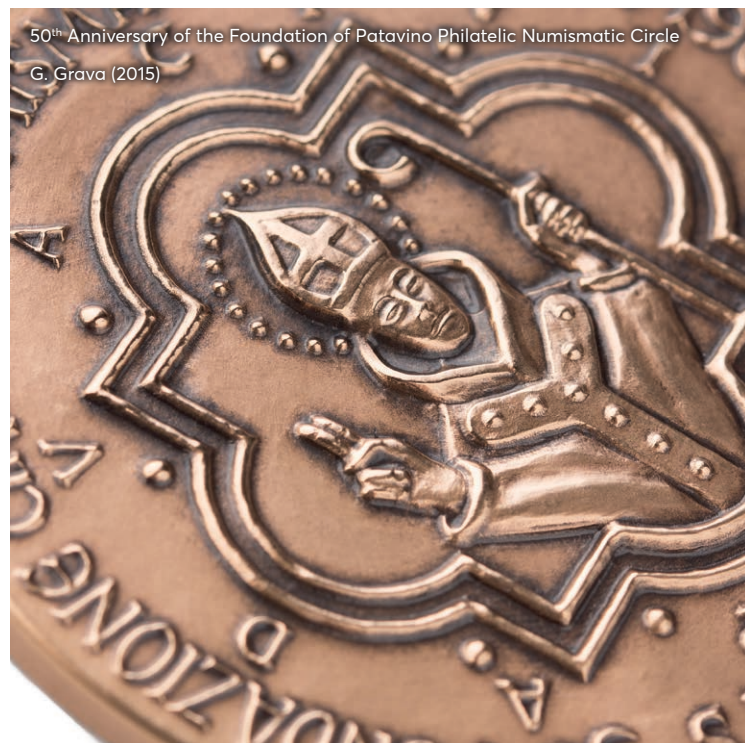
50 th Anniversary of the Foundation of Patavino Philatelic Numismatic Circle