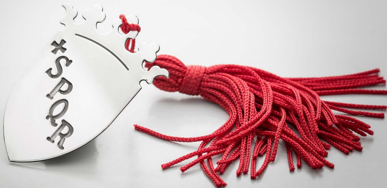
Bookmark – City of Rome