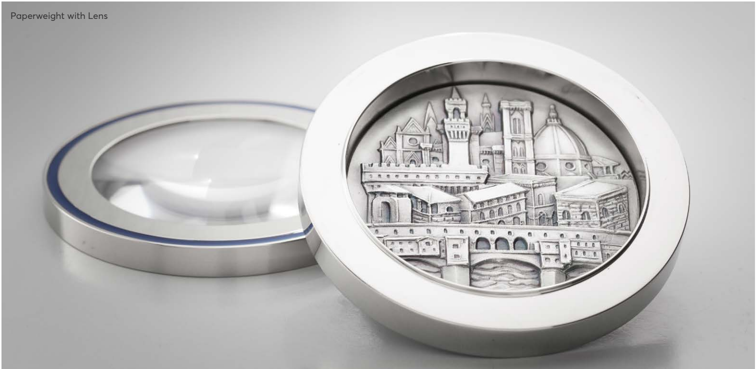
Paperweight with Lens