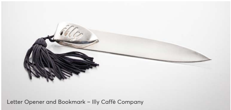
Letter Opener and Bookmark – Illy Caffè Company