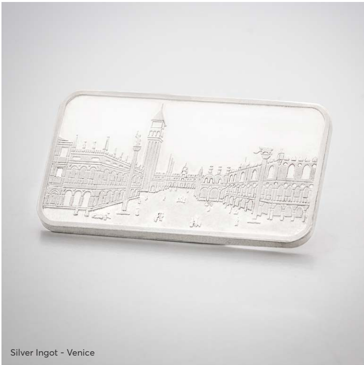
Silver Ingot - Venice