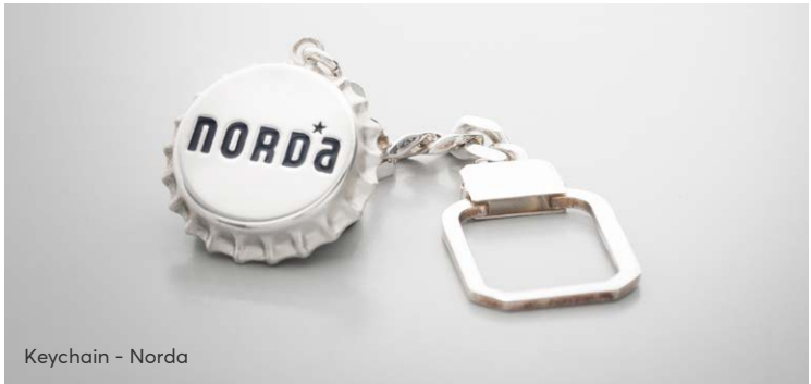
Keychain - Norda