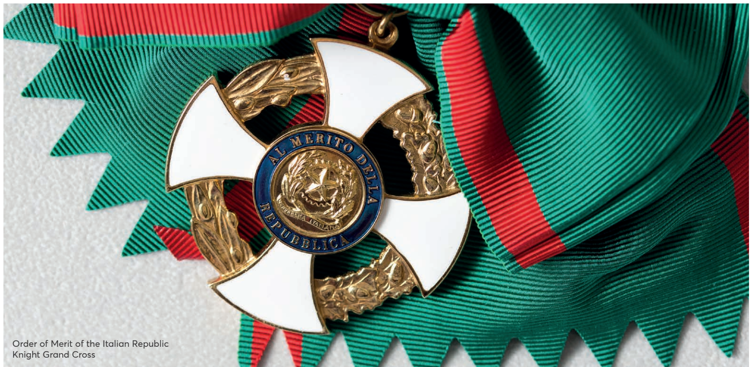
Order of Merit of the Italian Republic Knight Grand Cross