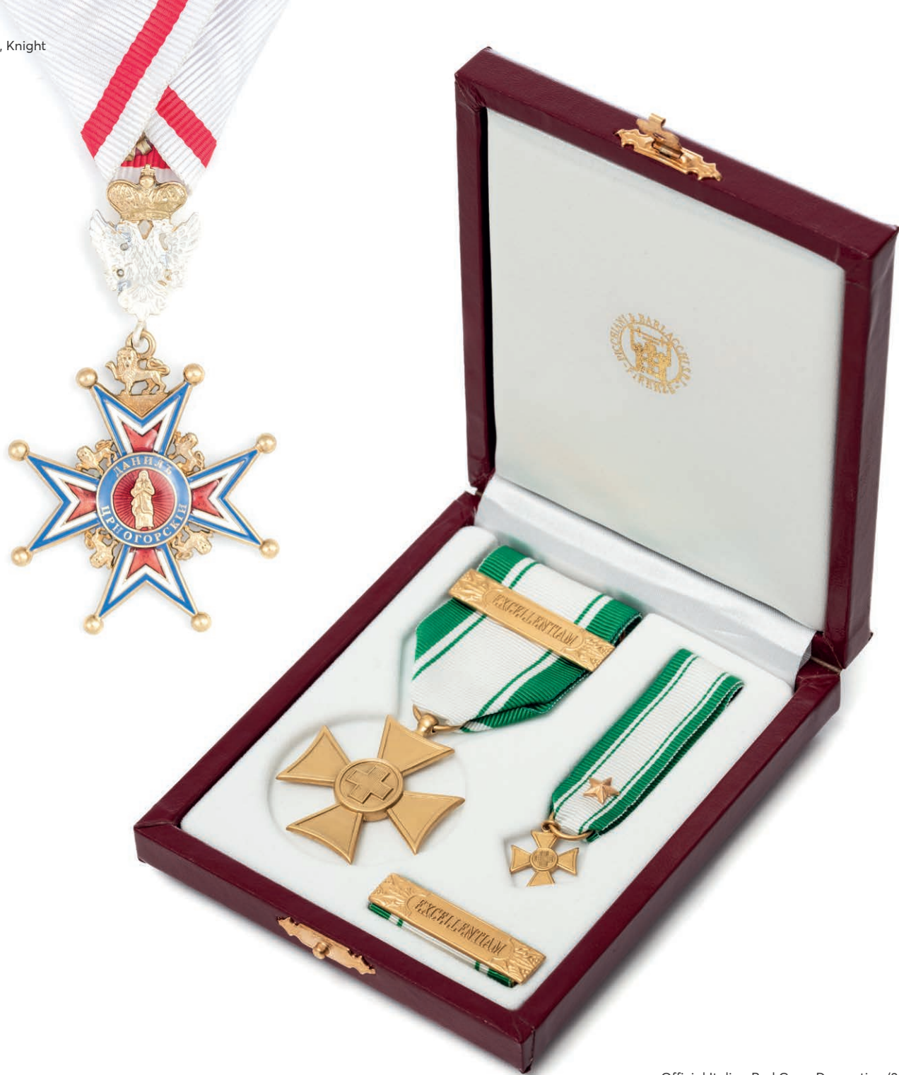
Official Italian Red Cross Decoration (2018)