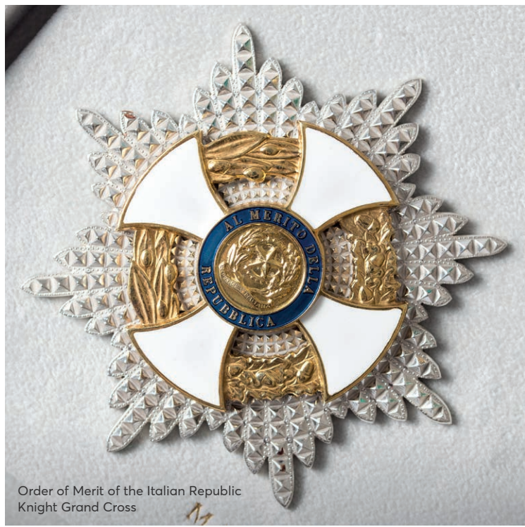
Order of Merit of the Italian Republic Knight Grand Cross