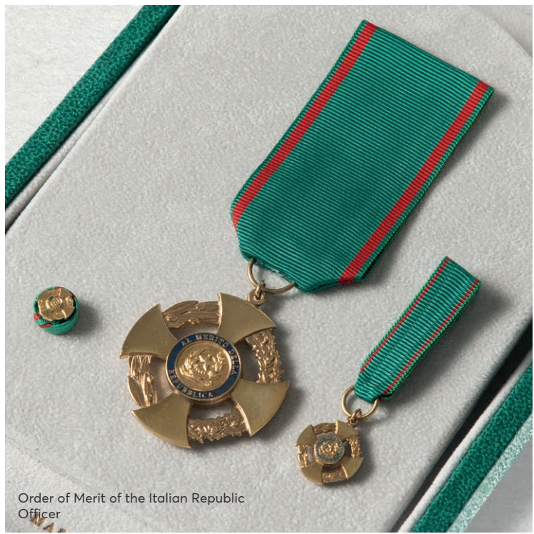
Order of Merit of the Italian Republic Officer