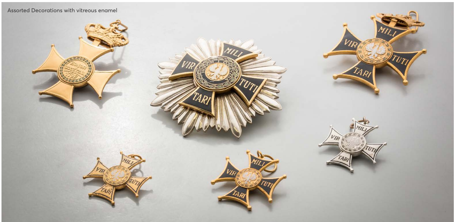
Assorted Decorations with vitreous enamel