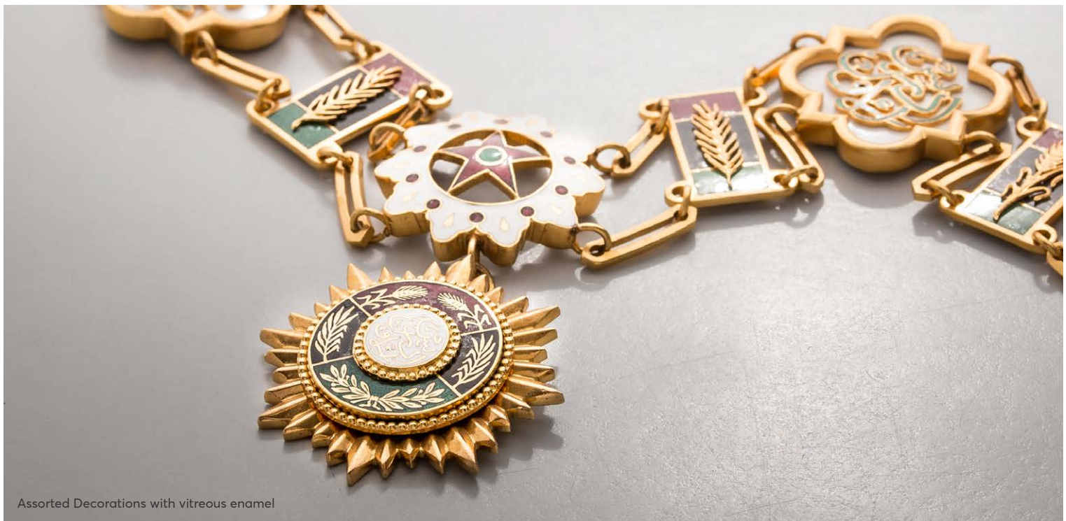
Assorted Decorations with vitreous enamel