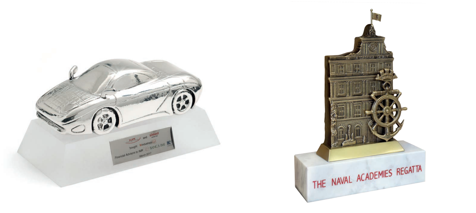
IMR Industries and Simest