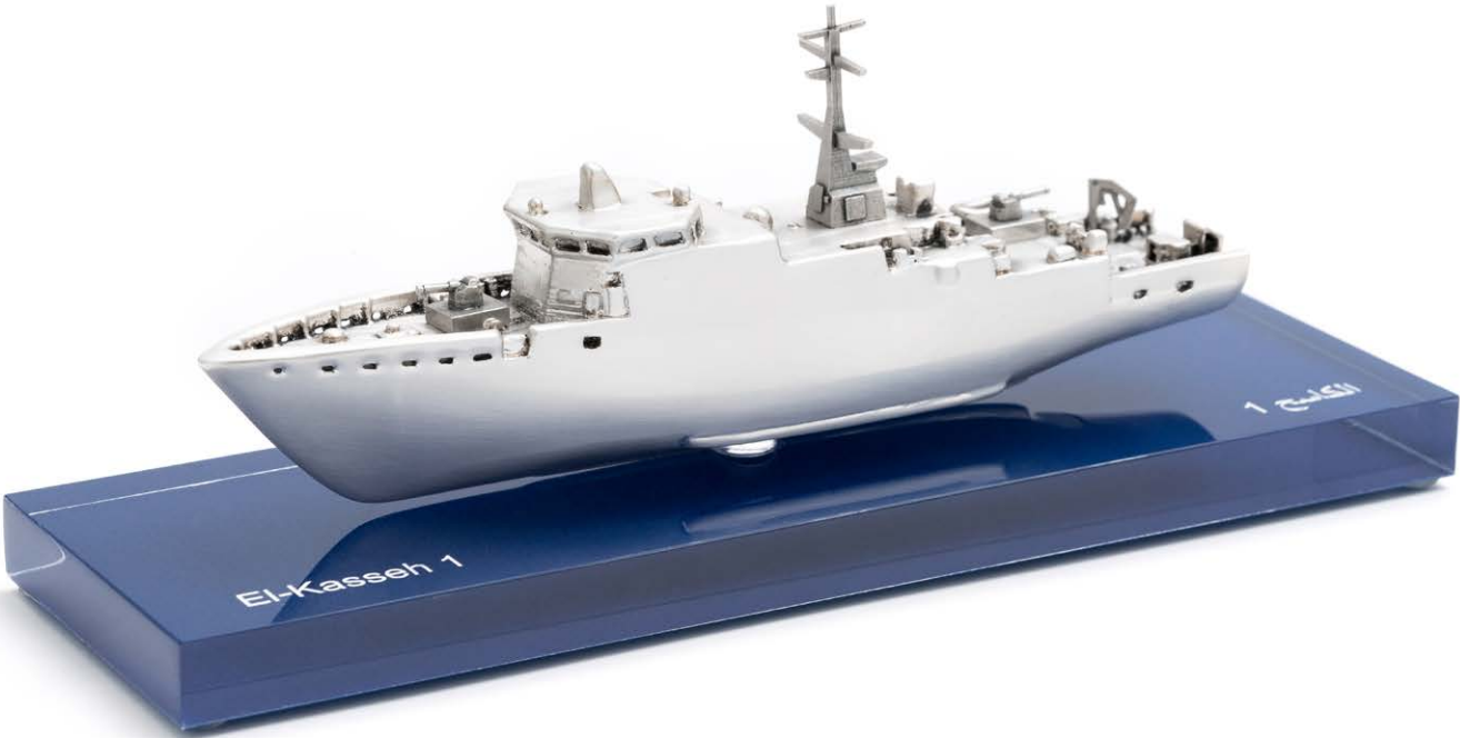
El Kasseh 1 Ship